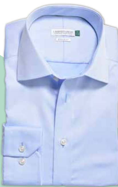
500 SKY BLUE