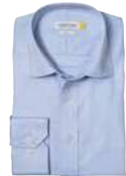
500 SKY BLUE