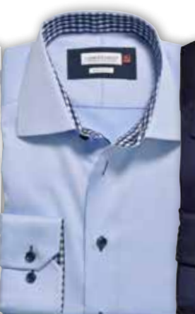
5066 SKY BLUE/NAVY