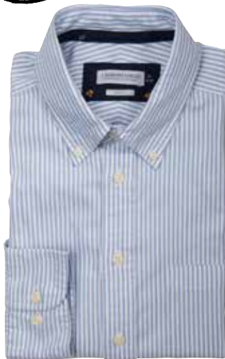
501 SKY BLUE STRIPE