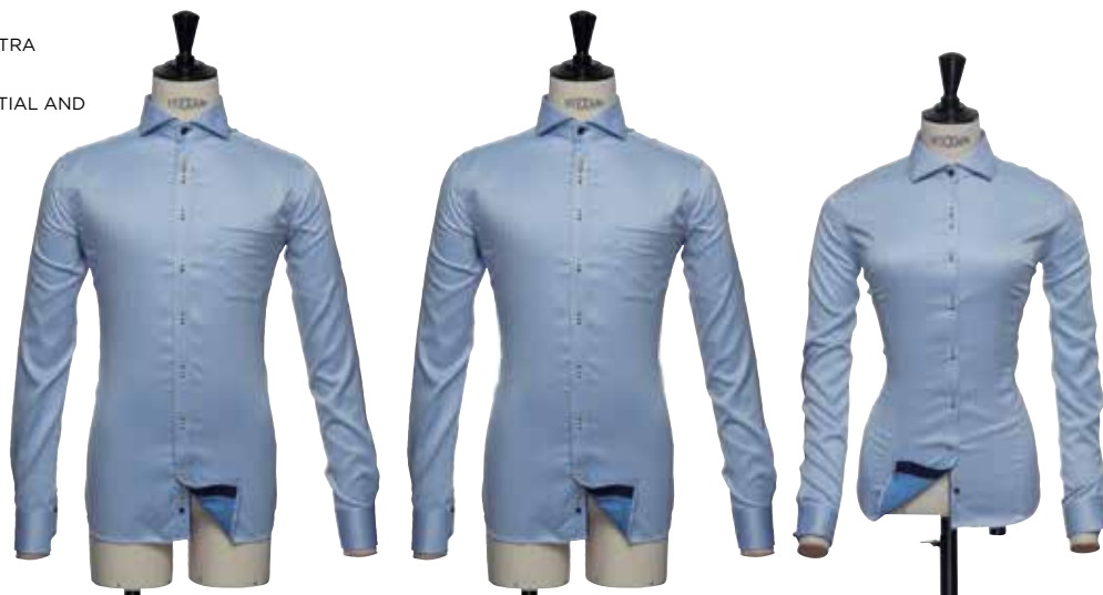
506 SKY BLUE