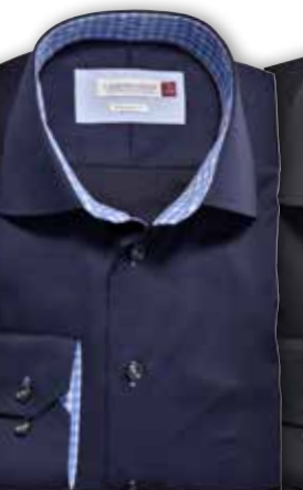
605 NAVY SKY BLUE