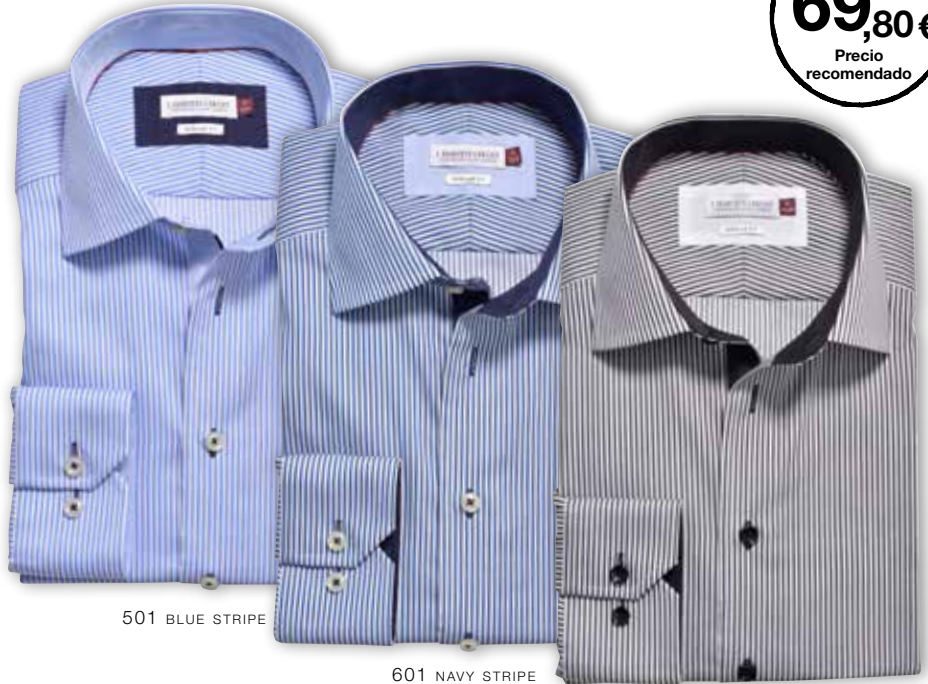
501 BLUE STRIPE