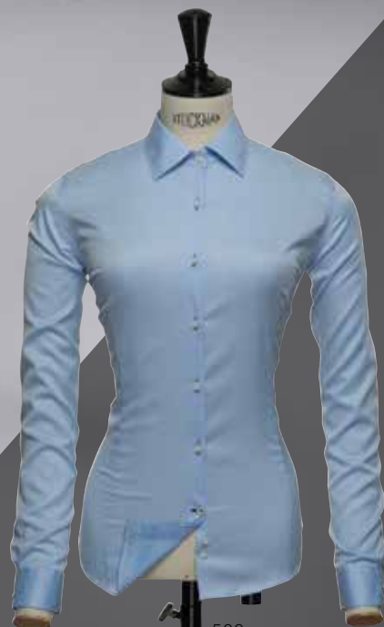
500 SKY BLUE