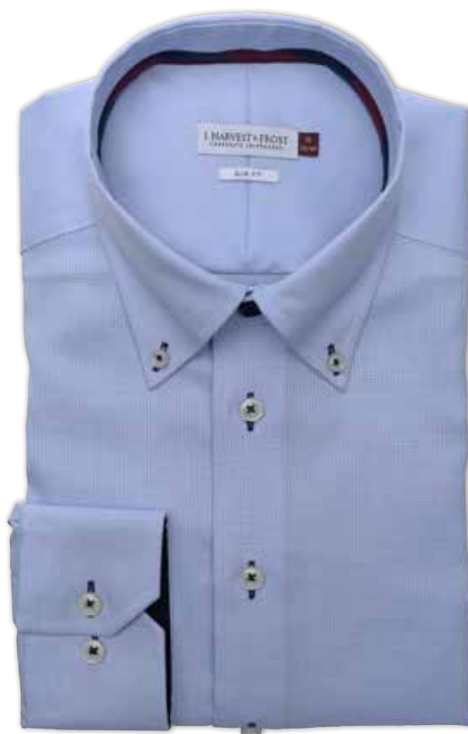
506 SKY BLUE