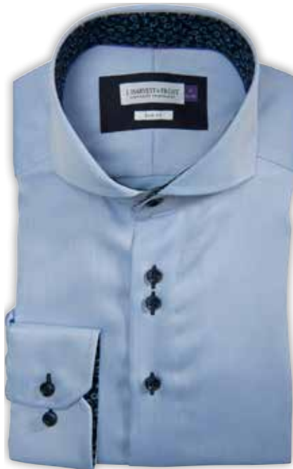
506 SKY BLUE