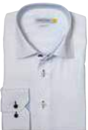
105 WHITE / SKY BLUE