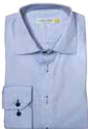
505 SKY BLUE / NAVY