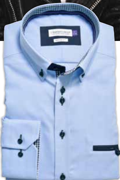
506 SKY BLUE