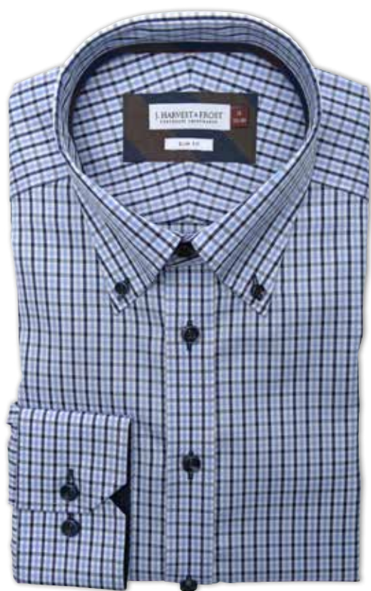
560 SKY BLUE/NAVY CHECK