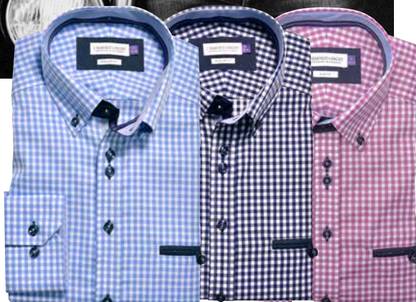
601 NAVY CHECK