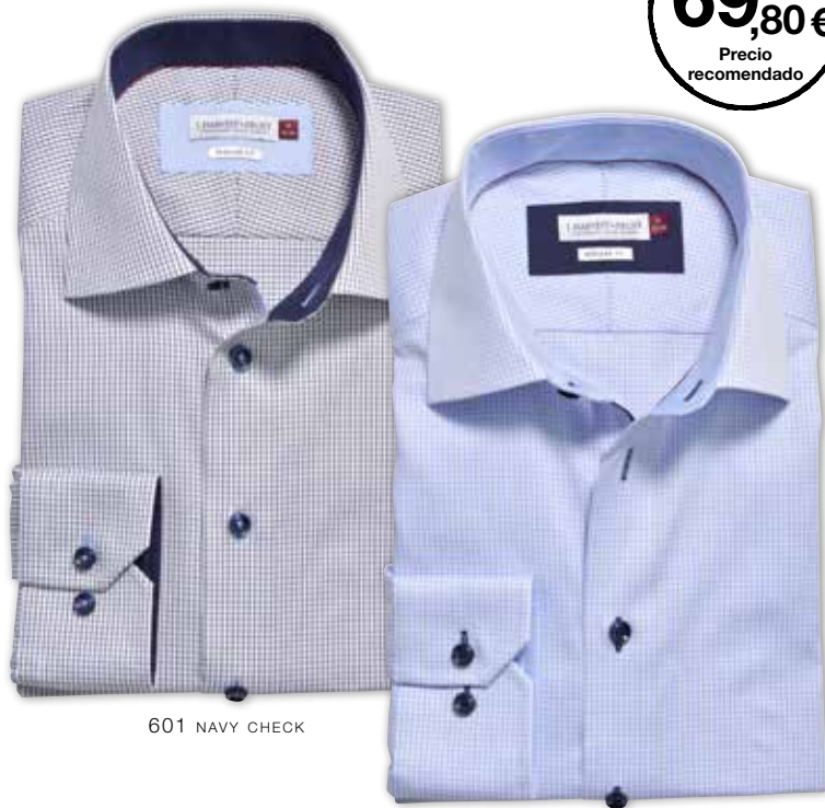
601 NAVY CHECK