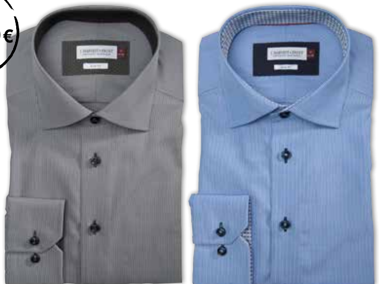
951 GREY STRIPE