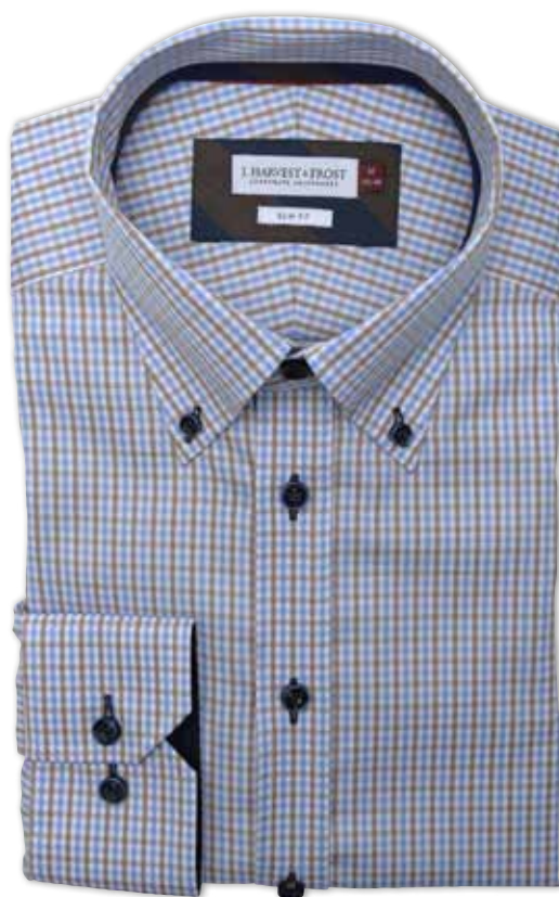
580 SKY BLUE/BROWN CHECK CHECK